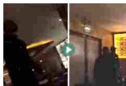
Pogba rifiuta autografo: rissa sfiorata