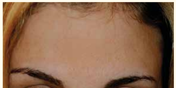
ACNE SCARS